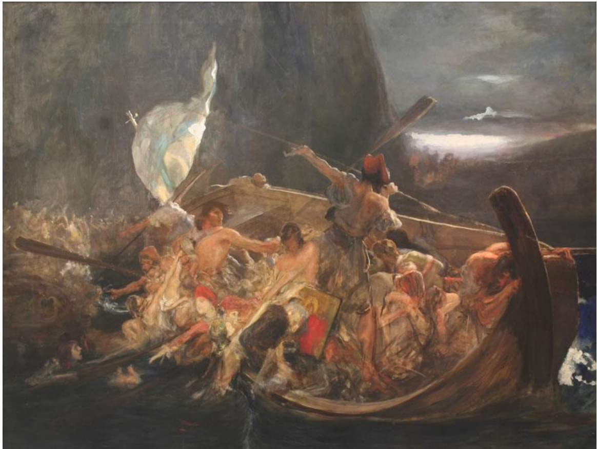
Εικόνα 1 Nikolaos Gyzis, 1896-1898 http://tooe-project.eu/home/detailOutput